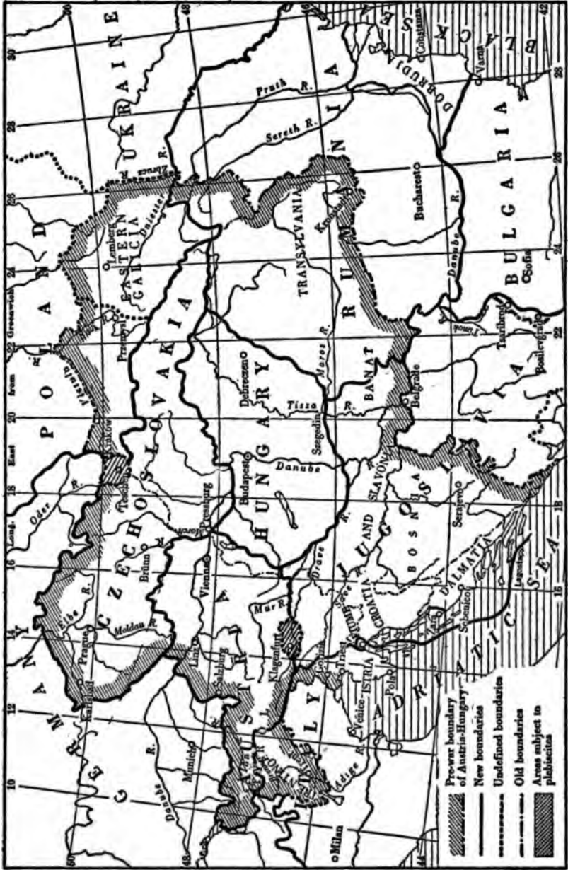
MAP SHOWING THE DISPOSITIONS OF THE TERRITORIES OF THE FORMER AUSTRIAN EMPIRE BY THE PEACE CONFERENCE